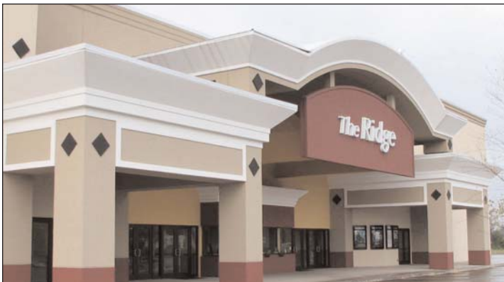
ICFs “deaden” sound: ICF’s concrete and foam are ideally suited for movie theatres.