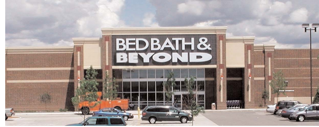
Only 1150 man hours were required to install 14,393 sq. ft. of ICF wall area enclosing this 30,400 sq. ft. building.

The concrete core in ICF walls resists damage from wind, fire, earthquakes, termites, rot, mold and mildew like no other wall system can. Not only are maintenance and insurance costs lowered, but risks to life and threats to business continuity are greatly diminished, so ICF-built structures hold their value for generations.