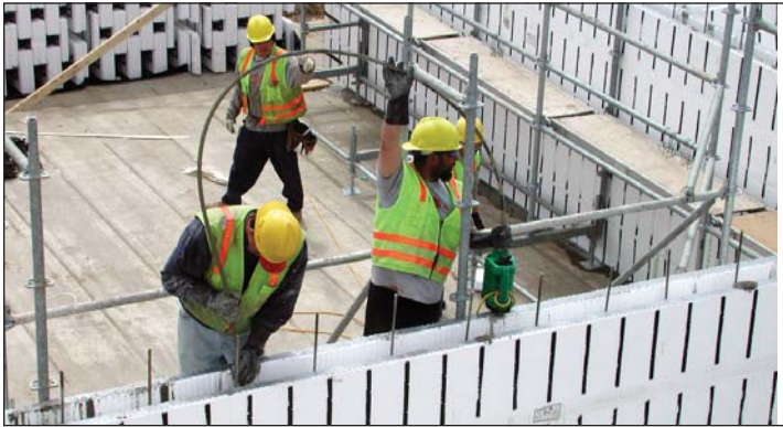
ICF components are lightweight: Forms go up faster and with fewer safety concerns as compared to other wall systems.