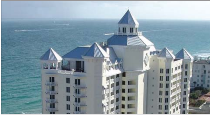
ICFs are versatile: From a one-story warehouse to high rise luxury buildings, ICFs fit the bill.